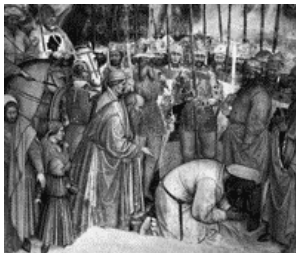
The Beheading of Saint George