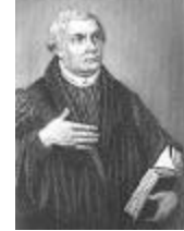
Martin Luther (1483-1546)

Image source: http://pweb.netcom.com/~supeters/luther.htm