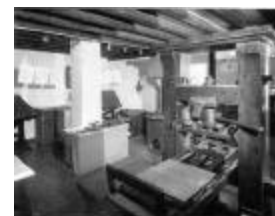
Model of the Gutenberg press in the Museum in Wittenberg.

http://mp.internet-exchange.com/renaissance/gutenberg.html