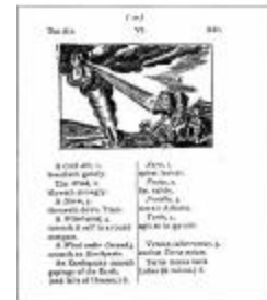
Image and text source: http://taa.winona.msus.edu/TAA/NOTABLE/comenius.html