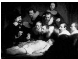
Photo courtesy of Adam McLean from his website The Alchemy Web Site http://www.levity.com/alchemy/index.html - see credits.