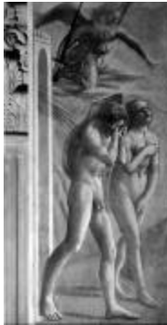
The Expulsion from Paradise