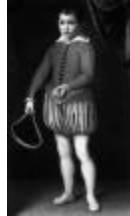
Master Painting (Cremona, 1570).