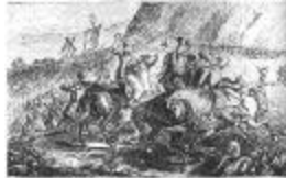
July 4th, 1187 the Battle of the Horns of Hattin.

http://4middleages.4anything.com/network-frame/0,1855,4860-13124,00.html