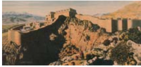
Mycenae in the Peloponnese