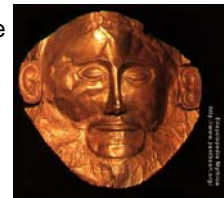
Mask of Agamemnon

http://www.pantheon.org/mythical/areas/greek_heroic/